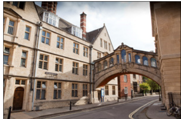
The Hertford bridge

Hertford College is located on Catte Street across from Bodleian Library and Radcliffe Camera. It also is known for the Hertford Bridge. To see and learn more about the college, go to https://www.hertford.ox.ac.uk/ .