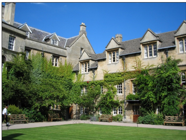
The Hertford College quad

WMU-Cooley will provide additional information and detailed reservation instructions for the Hertford College housing.